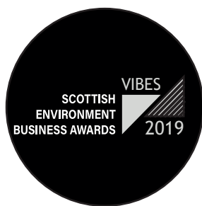
2019 Service Scotland Award