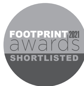
2021 Waste Prevention and Waste Management Award