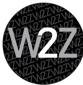
2020 Footprint Waste2Zero Awards