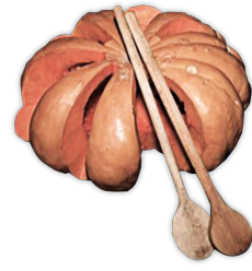
a pumpkin drum