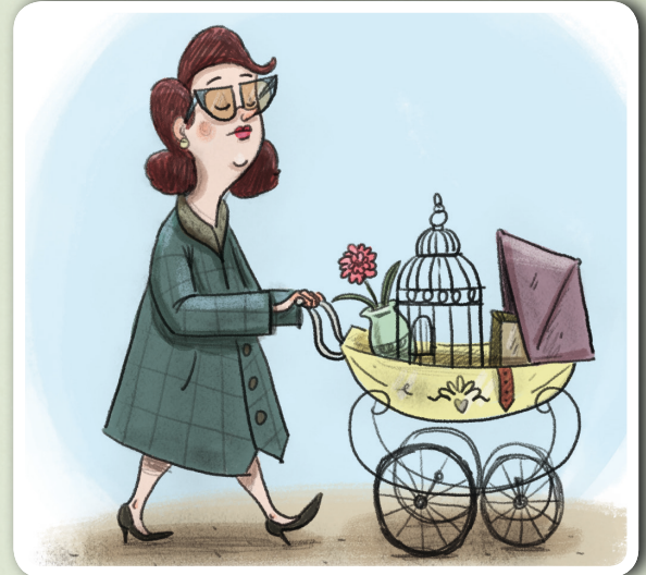
Dora the Storer